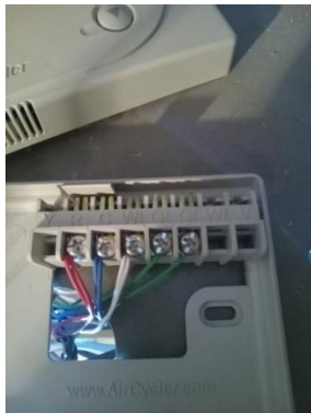
View of disconnected unit